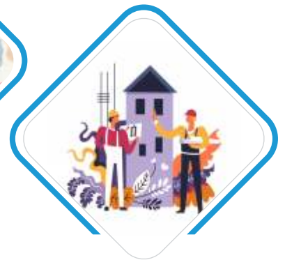
Tools of Estate Planning Will Nomination & Private Trust