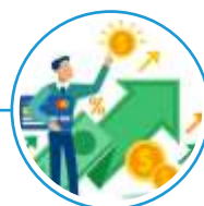
Employees of Financial Services Sector Companies