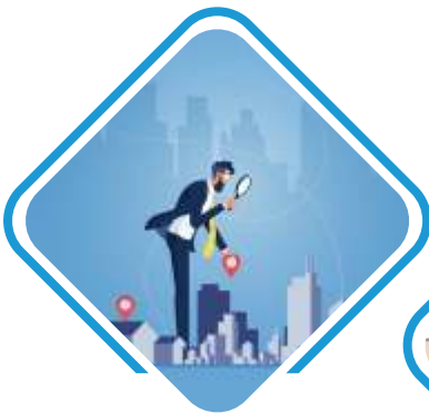
Importance of Estate Planning