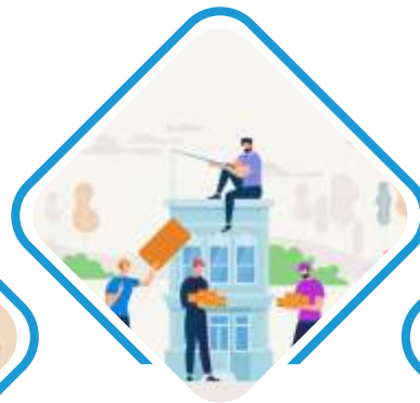
Role of HUF in Estate Planning