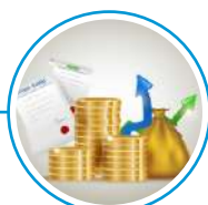
Mutual Fund Distributors