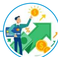
Employees of Financial Services Sector Companies