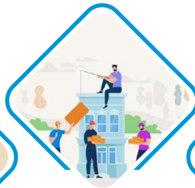
Role of Nominee & Joint Holder in Investments