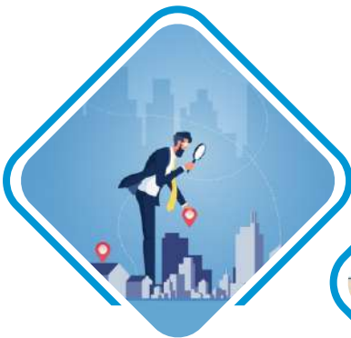
Importance of Estate Planning