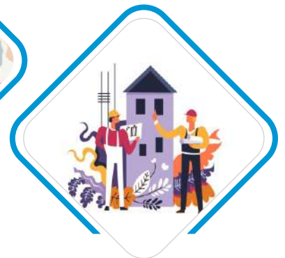
Tools of Estate Planning Will & Private Trust